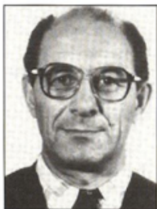
Vladimir I. Arnold

The Wolf Foundation has announced that Vladimir I. Arnold of the Steklov Mathematical Institute in Moscow and Saharon Shelah of the Hebrew University in Jerusalem will share the 2001 Wolf Prize in Mathematics. The prizes will be conferred at a special ceremony at the Knesset in Jerusalem, on May 13.