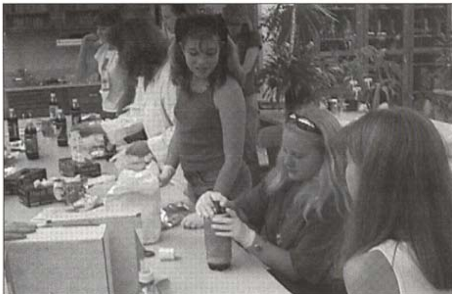
Participants in MASTER IT (Mathematics and Science to Explore careers-Investigating Together) an NSF funded summer outreach program at Emporia State University experiment with placing casts on soda bottles.

Both experienced and prospective program directors are invited to apply to participate in the conference. Team entries that pair an experienced director with a prospective director from the same geographic region will be especially welcome because this enhances the opportunities for continued mentoring. Partial travel support will be provided. Planned events include a workshop on grant writing, breakout sessions grouped by one day programs versus week(s)-long