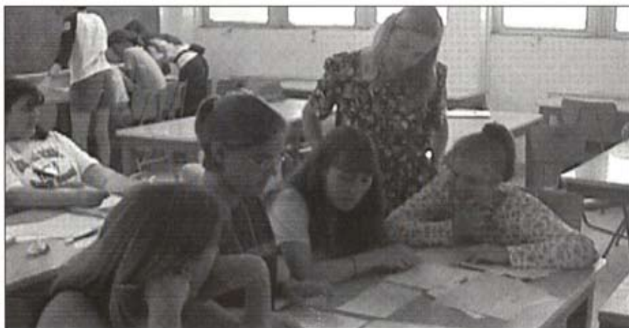
At Emporia State University, young women in MASTER IT, an NSF funded outreach program, work together to break a secret code.

The organizers hope that one major outcome of this conference will be the formation of regional support networks for prospective directors of outreach programs. Participants in Women Count will receive a directory of all participants and short descriptions of existing programs. A follow-up session will be held at the national AMS-MAA meetings to be held in San Diego, CA in January 2002. More information about the conference and an application form may be found on the Women and Mathematics Network web page at http://www.mystery.com/WAM/ . ■