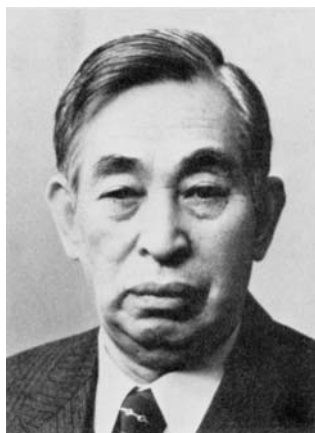
Professor Kiyoshi Ito of Koyoto University

A graduate of the Courant Institute, Professor Lax embodies the best traditions of Hilbert as continued by Courant. Among his many contributions are the solution of the Cauchy problem with oscillatory data, the clarification of the role of stability of a numerical scheme, the comprehensive development of scattering theory, the theory of non-linear conservation laws, and a deep insight into the Korteweg-de Vries equation. Professor Lax's influence has been profound and decisive in both pure and applied mathematics.