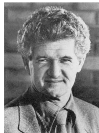
Professor Peter D. Lax of New York University