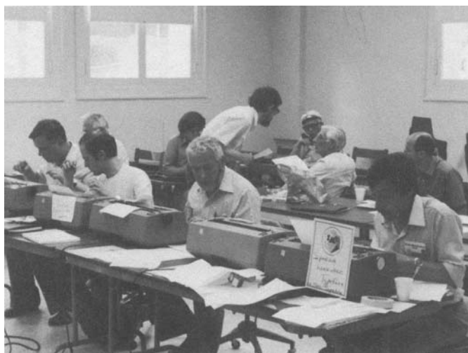
The examination questions had to be translated into seventeen languages. Here Jury members are hard at work typing the tests.