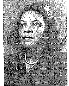
Marjorie Lee Browne

At this time one of Lorch's colleagues in the Fisk University Mathematics Department was Evelyn Boyd (now Granville), who had become one of the first two African American women ever to earn a Ph.D. in mathematics, both in 1949. The other was Marjorie Lee Browne. both went north to earn their doctorates, Boyd to Yale University and Browne to the University of Michigan; there was no institution in the south where an Afro-American could earn a doctorate.