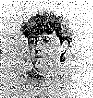
Charlotte Angas Scott

A Note in the April 1912 Monthly shows an interest in the numbers of women in mathematics: "According to the latest Annual Register of the American Mathematical Society, about 50 of the 668 members are women. It is interesting to observe that the American Mathematical Society has a much larger percent of women members than the leading mathematical societies of Europe. According to the latest register of the German Mathematical Society...only 5 of its 759 members are women; and only one of these 5 members is a German woman, while three of them are Americans and the remaining one is a Russian [2]. The French Mathematical Society also has very few women members. The numbers of women members of the Circolo Matematico di Palermo and of the London Mathematical Society are considerably larger but they are much smaller than in our own society."