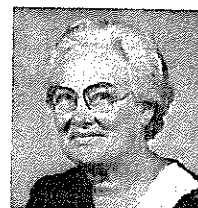
Mary Ellen Rudin

In the 1960's, women continued to hold only "fractional" positions. Mary Ellen Rudin, who earned her Ph.D. in 1949, under R.L. Moore at the University of Texas, is the author of more than seventy research papers, primarily in set-theoretic topology. In 1971, she began a term on the Council of the AMS, the