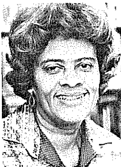
Evelyn Boyd Granville

The southern meetings seem to have been organized around the assumption that no Negroes will attend...Precise by-laws are needed to extend to all members the full benefits restricted to some by present practices...Interracial arrangements committees for southern meetings would also help since they would anticipate (and could therefore eliminate) a number of problems that might otherwise prove bothersome (Lorch in Newell, et. al., p. 312-313).